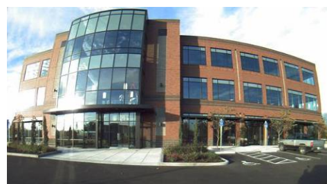
Typical wide angle lens